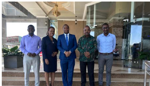
Communication focal persons for the HEET project from UDSM (MUCE, DUCE and Mwalimu Nyerere Campus) pose in a group photo during the meeting

A week-long meeting in Mwanza, Tanzania, brought together communication focal persons from various institutions participating in the HEET Project. The purpose of the meeting was to strategize and discuss effective ways to communicate the achievements of the HEET Project to the public, raising awareness about the project's goals and accomplishments.