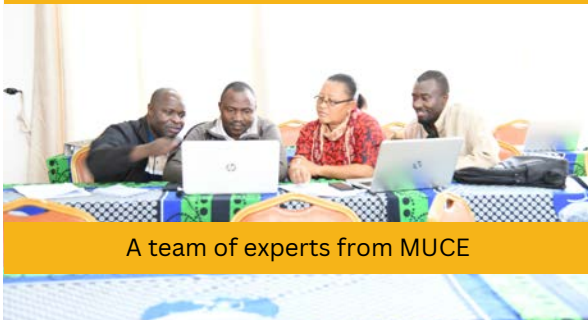
A team of experts from MUCE