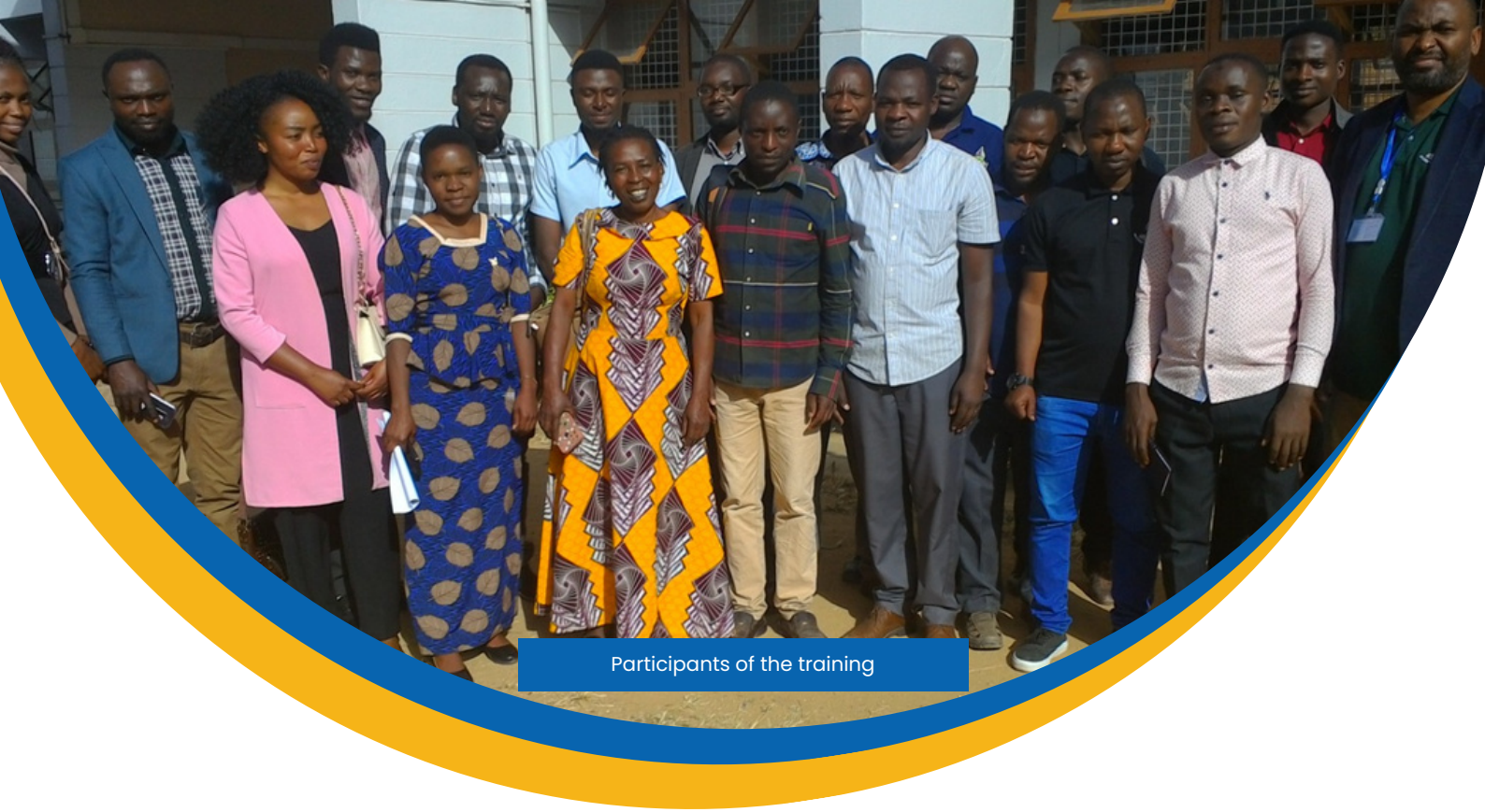
Participants of the training