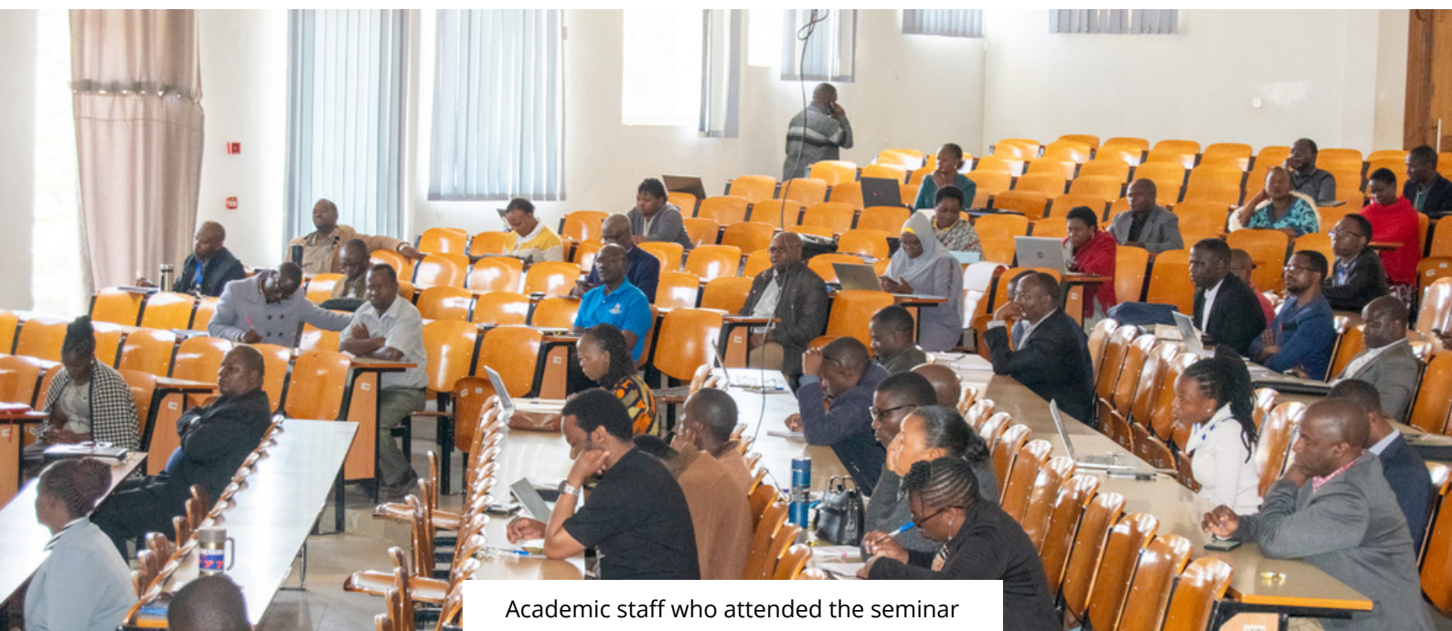
Academic staff who attended the seminar