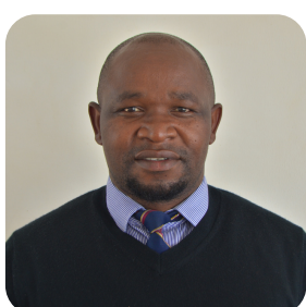
Facilitators of the teaching practice pre-supervision seminar