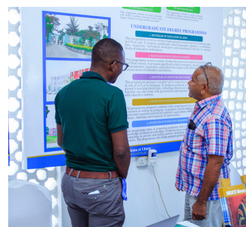
Various photos taken during the 47 th Dar es Salaam International Trade Fair (Sabasaba)