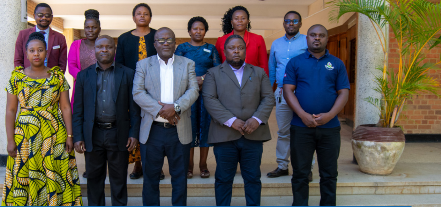
Facilitators of the training (second and third from right in the front row) in a group photo with members of two MUCE's disciplinary committees (Leadership and Management Committee and Integrity Management Committee).