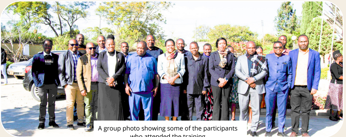
A group photo showing some of the participants who attended the training