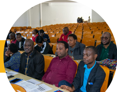
Some of the participants of the training

On 24 th June 2023, MUCE organized a seminar on the invigilation of university examinations and issues related to quality assurance. The seminar formed an opportunity for attendees to discuss essential rules and regulations pertaining to examination invigilation and ways to enhance the overall quality of the examination process.