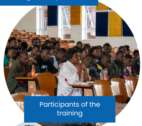
Participants of the training