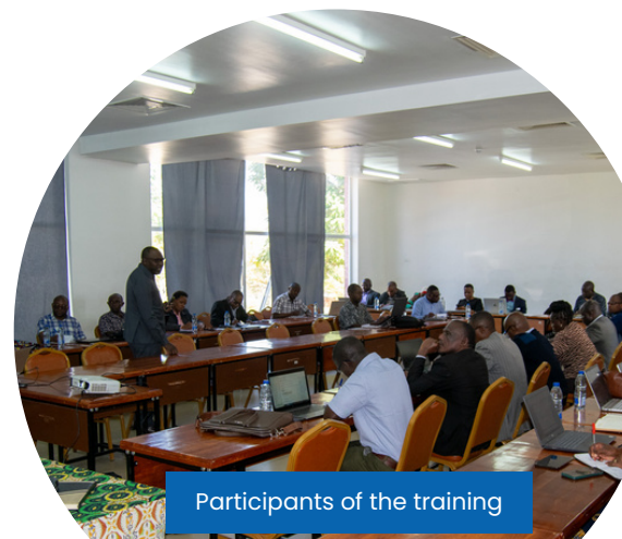
Participants of the training