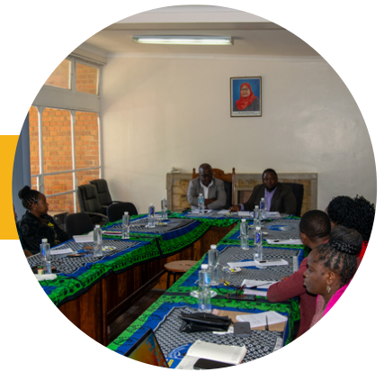
Facilitators of the training (first picture from left) and members of MUCE's disciplinary committees (last two pictures).